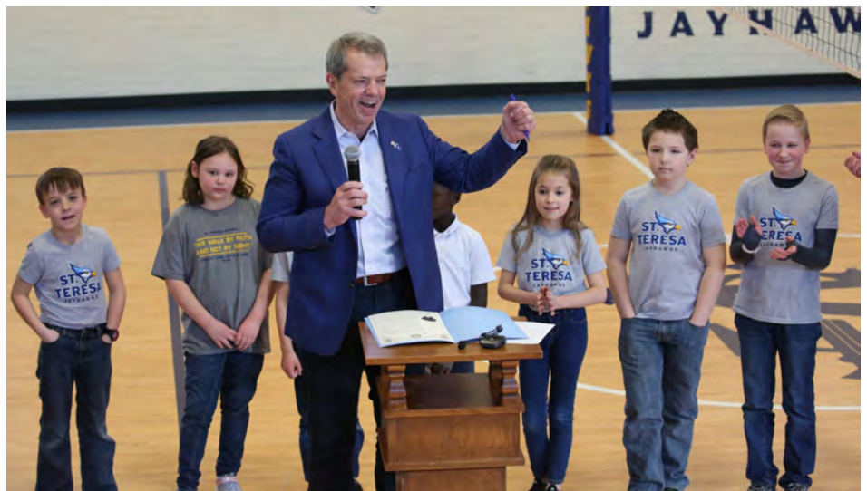
Nebraska Governor Jim Pillen visited St. Teresa School to sign the proclamation for Catholic Schools Week. Students prayed a decade of the rosary for Governor Pillen and sang God Bless America!