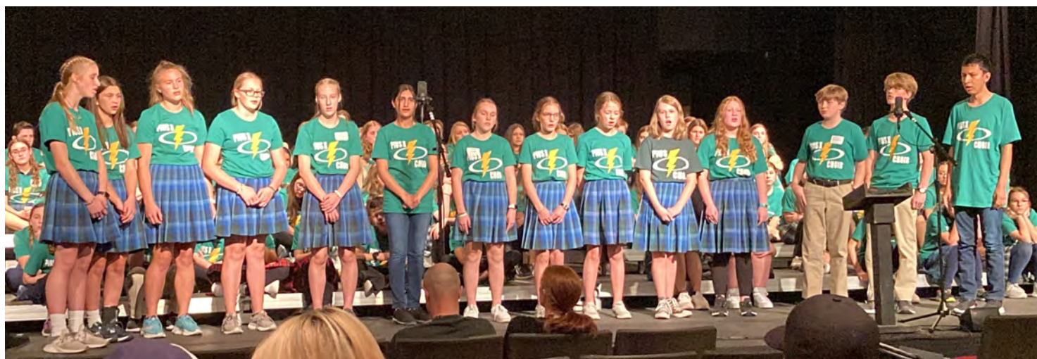
Jr. High Honor Choir: 7th and 8th grade students had the opportunity to sing with other Catholic school students at Pius X High School for a day-long honor choir event. Before the final concert the St. Teresa students performed a song for the rest of the participants.