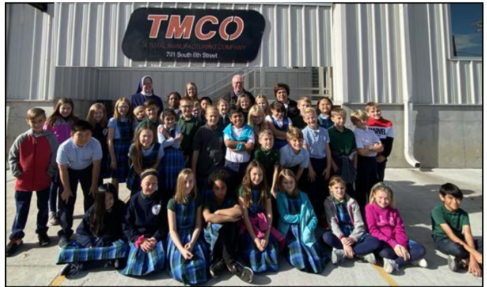
Thank you Junior Achievement and TMCO from St. Teresa Fourth Grade!