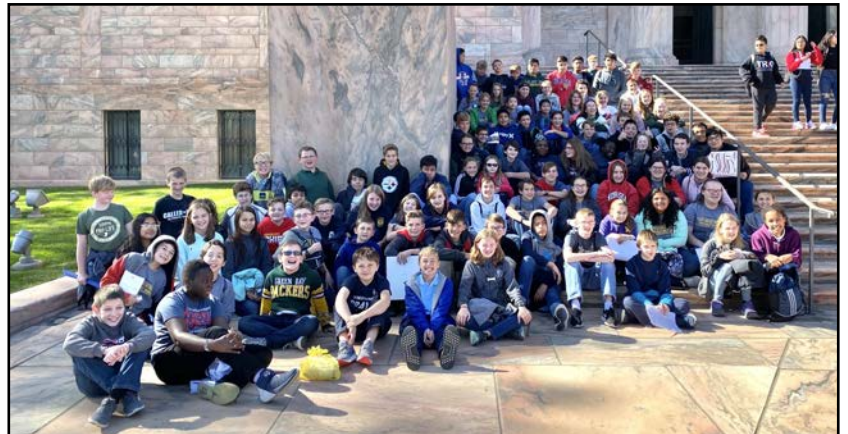
Grades 6, 7, and 8, in front of the Joslyn Art Museum

Junior High and 6th grade students attended the Celebrate Creativity Workshops at the Joslyn Art Museum. This field trip was made possible by a generous benefactor. Students worked "to discover their own artistic talents, explored music, visual art, theatre, dance, martial art, and technology." They also experienced a live concert with the Omaha Symphony