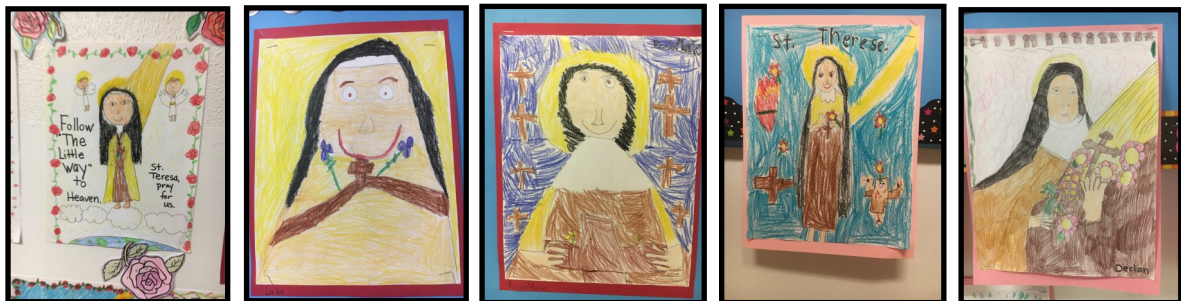
St. Therese pictures created by Grade 3 students.