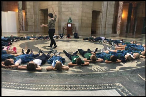
4th grade students enjoying the beauty of the rotunda ceiling on their field trip to the Nebraska State Capitol