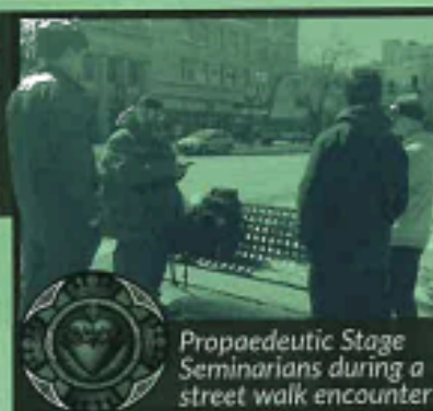
Propaedeutic Stage Seminarians during a street walk encounter

Please join us as we share additional glimpses into their servant-hearted work and celebrate their service, which truly exemplifies the Heart of Christ!